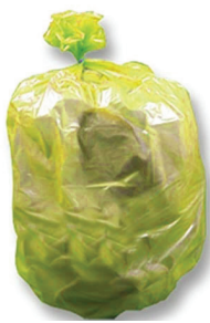
Infectious Linen Bags