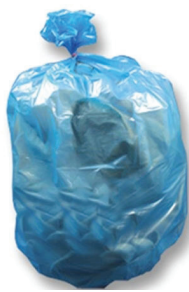
Soiled Linen Bags