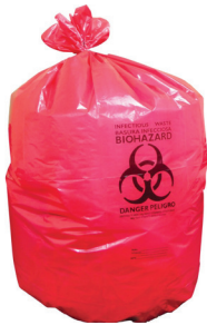
Biohazard Infectious Waste Bags

American Paper & Twine can help whether you need a custom imprint, a non-standard size, or a liner for a specific application. Often a clear bag is preferred for security purposes, but our specialists will work with you to identify the best bag for your needs.