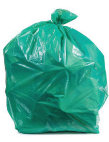
Biodegradable and Compostable Bags