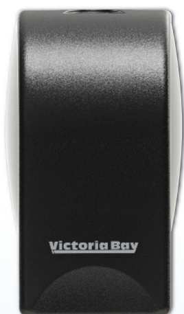
AP&T ITEM # 770231 VB# 348252 VICTORIA BAY POWERED WHOLE-ROOM FRESHENER DISPENSER 4.1"x3.6"x6.8"

VOC Compliant: Compliant for VOC content with applicable federal and state regulations.