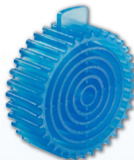
AP&T ITEM # 770232 VB# 348253 POWERED WHOLE-ROOM FRESHENER DISPENSER REFILL COASTAL BREEZE • 12/CASE

Easy to Maintain: Simple installation and easy access design makes maintenance a breeze.