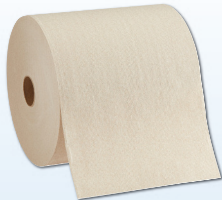
AP&T ITEM # 460025 VB# 346359 VICTORIA BAY 8" RECYCLED PAPER TOWEL ROLL BROWN • 1150 FT/ROLL • 6 ROLLS/CASE