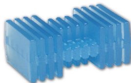
AP&T ITEM # 450024 VB# 348254 AUTOMATED IN-STALL FRESHENER DISPENSER REFILL COASTAL BREEZE • 12/CASE

Anti-theft: Key and lock provides ample security to help reduce the risk of vandalism or theft.