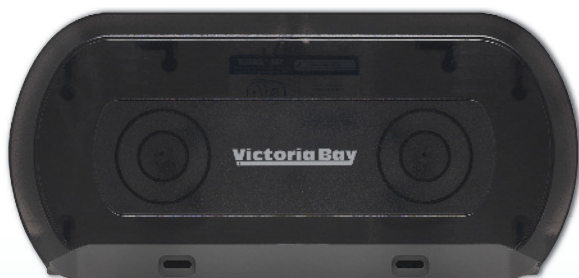
AP&T ITEM # 450022 VB# 346368 VICTORIA BAY TISSUE DISPENSER, 2-ROLL 15"x4.35"x7"

Helps eliminate stub roll waste with the combination of a coreless roll and having only one roll accessible at a time.