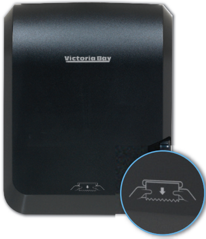
AP&T ITEM # 460024 VB# 346356 VICTORIA BAY MECHANICAL PAPER ROLL TOWEL DISPENSER 12.9"x9"x16"