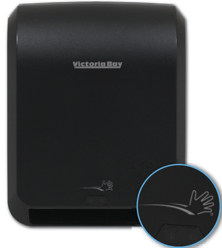
AP&T ITEM # 460026 VB# 346357 VICTORIA BAY AUTOMATED PAPER ROLL TOWEL DISPENSER 12.9"x9"x16"

Easy to Maintain: High-capacity 1150-ft towel rolls last longer, requiring less maintenance and minimizing refill frequency.