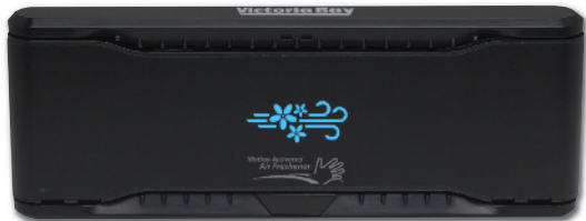
AP&T ITEM # 450025 VB# 347050 VICTORIA BAY AUTOMATED IN-STALL FRESHENER DISPENSER 1.2"x9.6"x3.5"