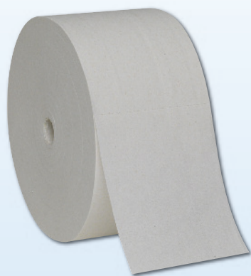
AP&T ITEM # 450023 VB# 346353 VICTORIA BAY TISSUE, 2-PLY WHITE • 1700 FT/ROLL • 24 ROLLS/CASE

High Capacity for Operational Efficiency: Holds 2 perforated rolls of 1,700 2-ply sheets. High capacity meaning fewer change outs and helps reduce labor cost.