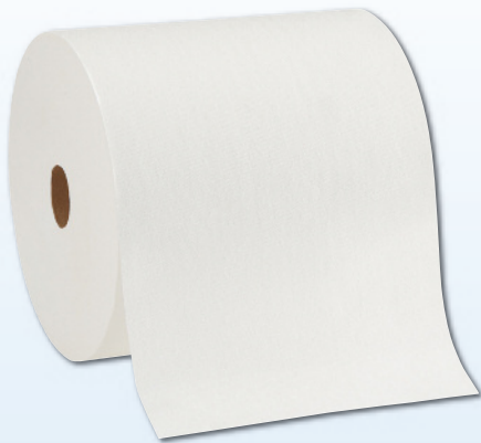
AP&T ITEM # 460023 VB# 346358 VICTORIA BAY 8" RECYCLED PAPER TOWEL ROLL WHITE • 1150 FT/ROLL • 6 ROLLS/CASE

Affordable Quality: The high-quality choice with one-at-a-time towel dispensing to help prevent waste.