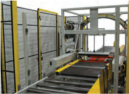
ORBITAL WRAPPING SOLUTIONS

Turntable models turn the pallet load on a turntable while the film carriage moves up and down on a mast. Many customers prefer turntable models for their smaller footprint and easy portability. Turntable drive systems use different support systems, so users must match the weight capacity of the machine (usually 4,000 to 6,000 lbs.) to the maximum load weight that will be processed.