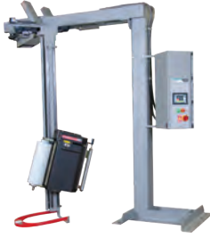
FLEX RTD ROTARY TOWER DELUXE