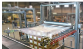
Top Sheet Dispenser (Wrap area model also available)