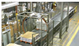
6-Sided Wrapping System