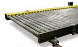
Low Pass Height