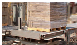
90 Degree Turn Conveyor