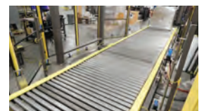
Extra Heavy Duty 6,000 lb. Capacity