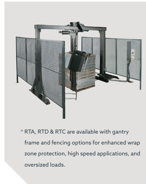
* RTA, RTD & RTC are available with gantry frame and fencing options for enhanced wrap zone protection, high speed applications, and oversized loads.