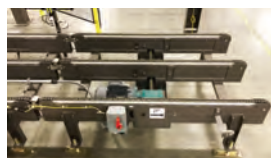
Chain Transfer Conveyor