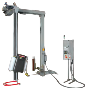
Shown with options, including free standing HMI pedestal.

Rotary tower machines rotate the stretch film around a stationary load which is well-suited for pallet loads that are fragile, unstable, very light or very heavy. These machines are also ideal for applications that require frequent wash-down in the wrapping area since the drive mechanism is above the load and the wrapping area remains clear. Because pallet loads are wrapped on the floor, there is no weight limit and loads are easy to load and unload. Choose between the semi-automatic model which requires manual attachment of the film tail, and manual film cut/wipe, or the stand alone automatic model which automates the process.